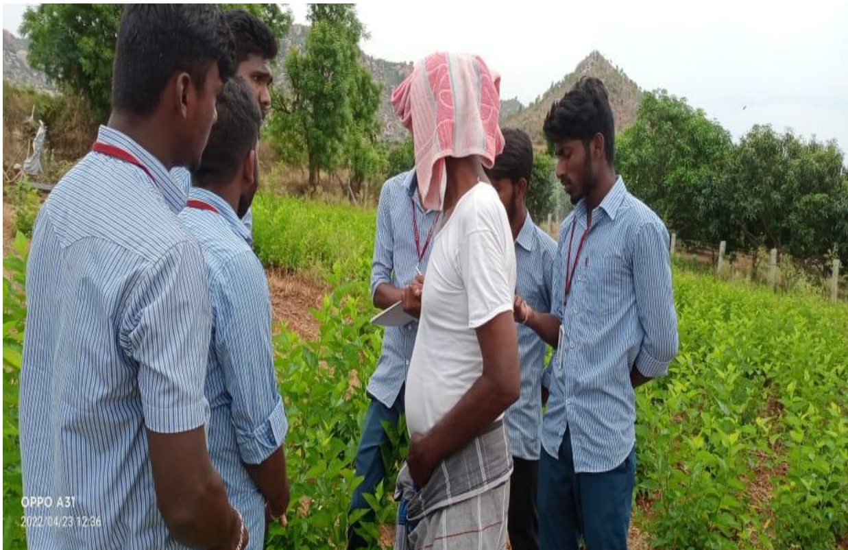
Interacting with sericulture farmers and learning about selfemployment in sericulture